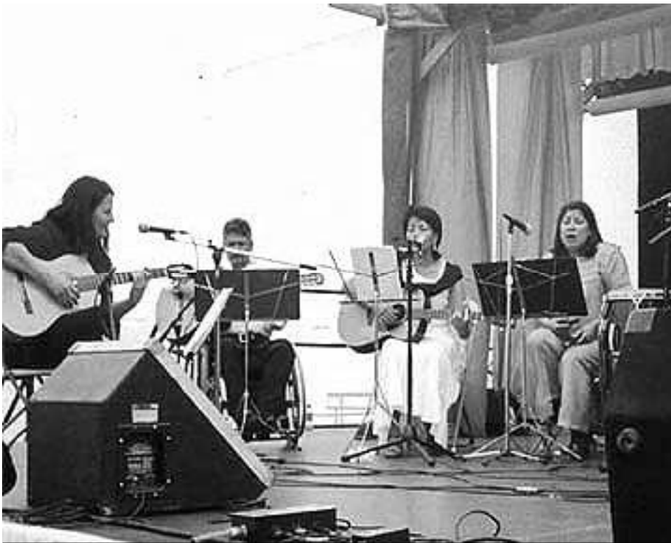
One of the performers at this year's Rogue Festival will be the musical group Rondalla Nuevo Mundo - New World Acoustic Ensemble

ater, dance, and music at Starline, Club Fred, Veni Vidi Vici; visual art at Ashtree Studio (1035 North Fulton), Salon 637 (637 East Olive), and Recycrom Galley, (604 Olive); and film at the Rogue Film Venue (641 East Pine).