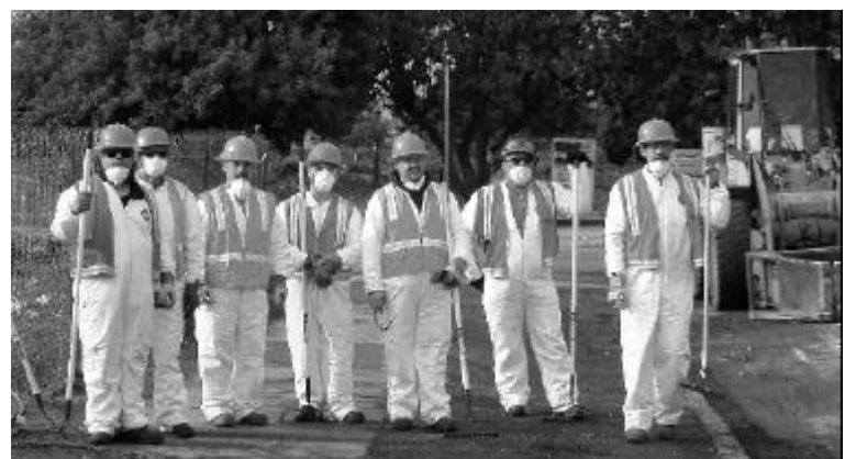
Sanitation workers dressed in bright orange vests, rubber gloves, and masks move in behind police

Edie Jessup, who works for Fresno Metro Ministry, says that "there is money out there to address the homeless issue. What is needed is a comprehensive, 24-hour supervised shelter for both single adults and families with all the wraparound services to get folks into permanent housing. That would include medical, mental health, substance abuse treatment services, and job training. There should be a separate medical detox available. What we have is far from what we need in Fresno. Now is when we need to mobilize the solution and garner the resources to provide a continuum of services for the homeless."