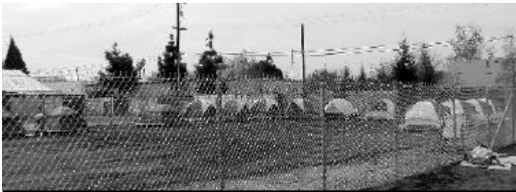
This is the housing provided by the Poverello House as an alternative to the encampment on Santa Clara Street