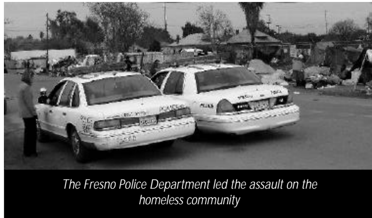
The Fresno Police Department led the assault on the homeless community

Although other tactics were chosen to deal with the crime problems at River Park, the police descended on the Santa Clara encampment shortly after daybreak on February 4, in a highly coordinated multi-agency attack. In a show of overwhelming force, the FPD arrived in squad cars, on bikes, and in plain clothes. After securing the area with road blocks, they brought in the Fire Department and extinguished the fires that provided the homeless with the only heat they had. Following the police and the fire departments were the sanitation workers wearing face masks, bright orange vests, and rubber gloves. Behind them was the bulldozer that lifted whole