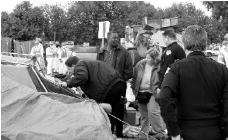
Undercover and uniformed officers negotiate with a homeless man who doesn't want to move

they are coming down here to help, but they do the opposite. We've taken care of a crime. We've stopped a lot of crime in this area: it's about taking care of our brothers and sisters."