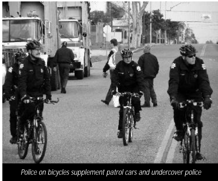
Police on bicycles supplement patrol cars and undercover police