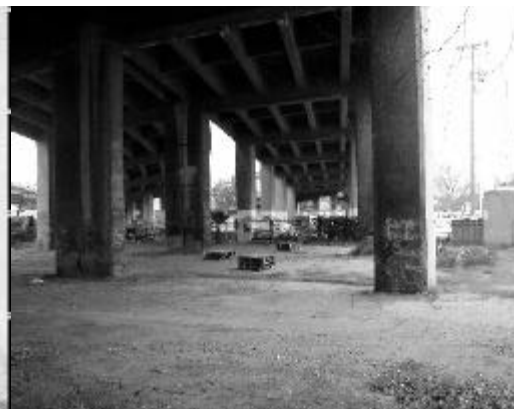
In the latest twist on the attack against the homeless in Fresno, the Fresno Rescue Mission and the Police Department want to build an outdoor drunk tank on this site.