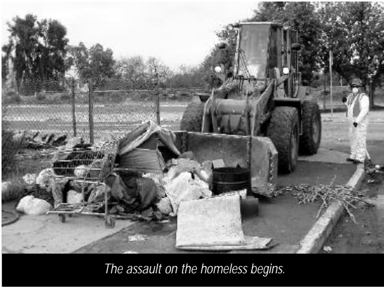
The assault on the homeless begins.

In a coordinated multi-agency attack on homeless encampments earlier this month, the City of Fresno destroyed tents and other shelters used by the homeless in this community. Reversing a policy implemented a couple of months ago, the Fresno Police Department (FPD) has returned to the tactic of not allowing the homeless to build any permanent structures. With thousands of homeless on the streets in Fresno, and homeless shelters able to provide only a couple hundred beds, a majority of the homeless have been turned into criminals. If you are homeless and can't get into a shelter, you are breaking the law if you try to sleep anywhere in this city. This new policy penalizes the homeless and criminalizes poverty.