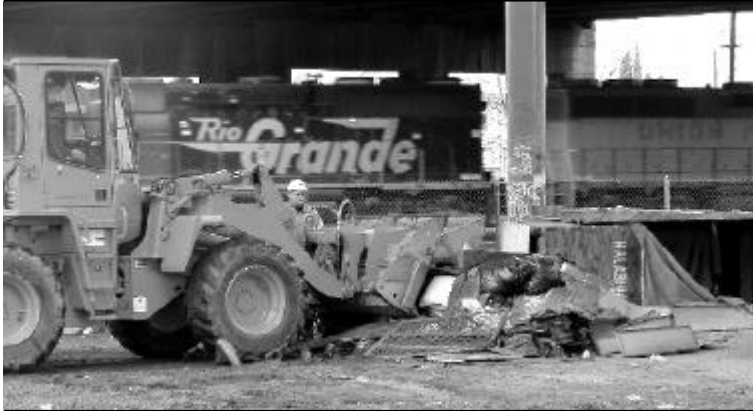
CalTrans destroys H Street encampment